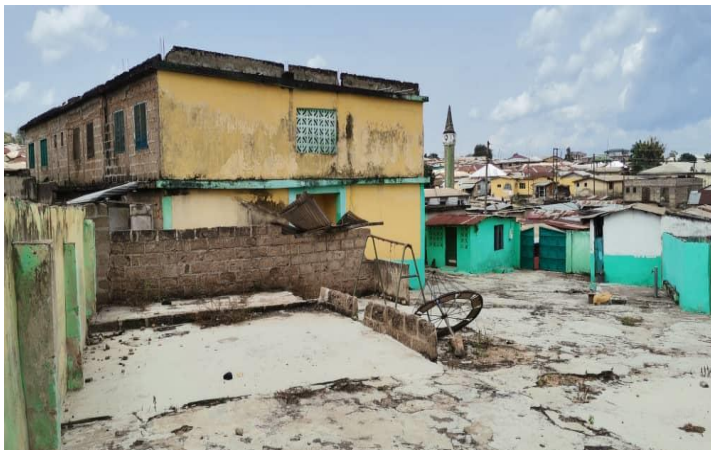
Figure 2: Old-Site for the KG and Primary