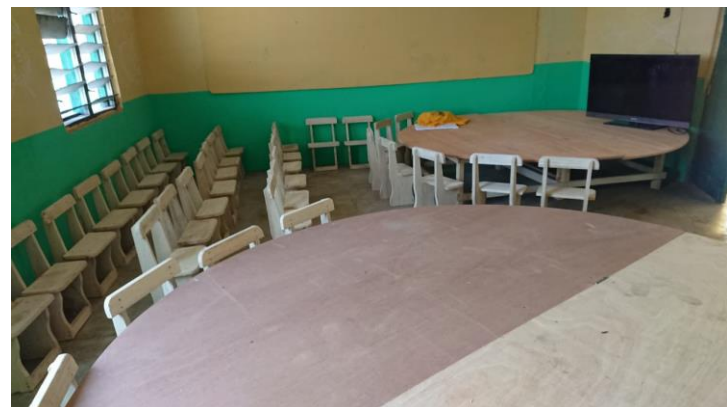
Figure 7: Sets of new tables and chairs readied for the kindergarten classrooms as well as a television set to arouse interest in learning.