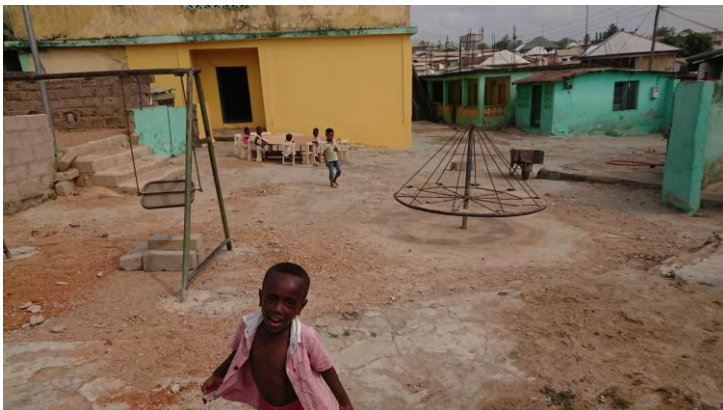
Figure 5: Now playing ground, Painting work at the old-site

Painting works ongoing and classrooms getting ready for the kindergarten 1 & 2 pupils in the coming academic year calendar. This is a great relief knowing measures to reopen the school is gradually taking shape and the hope of stepping foot in the classroom brings an excitement to many of the in-house children and families within the community. We do receive calls from parents asking when school will be reopening to their children and that brings us joy and relief knowing we are being monitored and our efforts are being noticed.