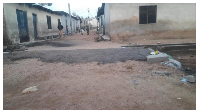
Figure 3: Walkway to the old site (after)