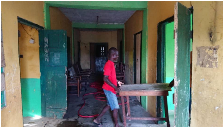
Figure 4: Renovating/Painting in classrooms at the old-Site