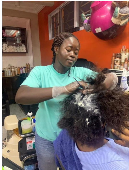
Figure 9: YLF apprenticeship beneficiaries