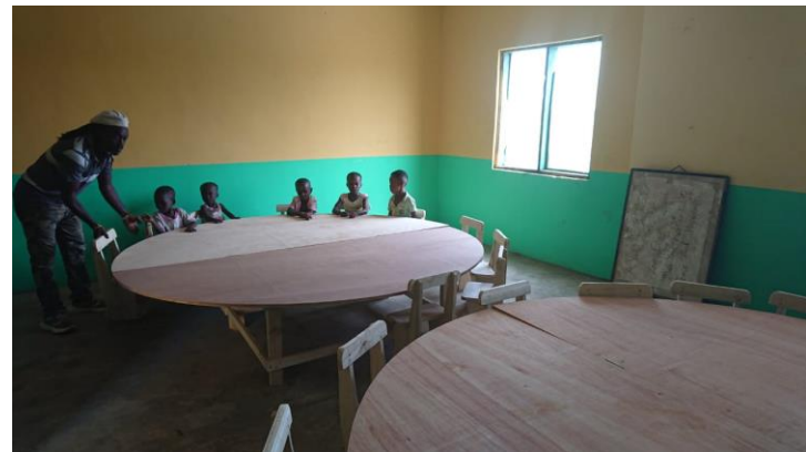
Some in-house kids excited with their new classroom

The YLF team is overwhelmed with the great things little efforts can change in our society. So far, donations received has helped changed the face of the school; the classrooms renovation, painting, kindergarten tables and chairs, television, playground and many more as shown in the pictures. Our desire to do more has been awakened and to touch more lives is on course.