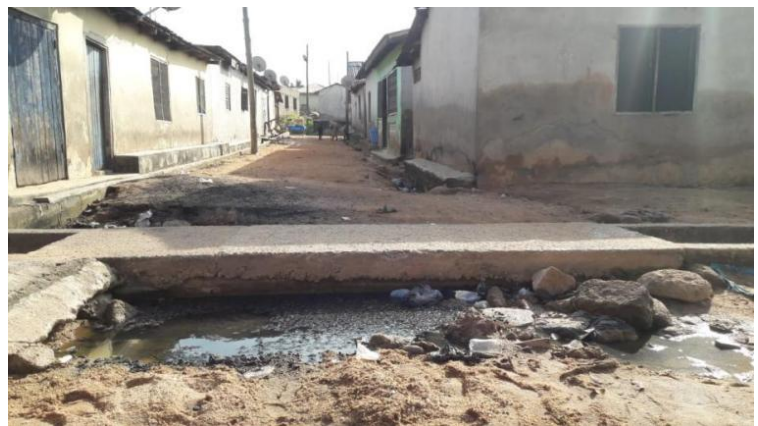
Figure 2: Walkway to the old site (before)