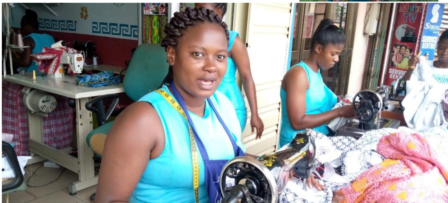
Figure 9: YLF apprenticeship beneficiaries