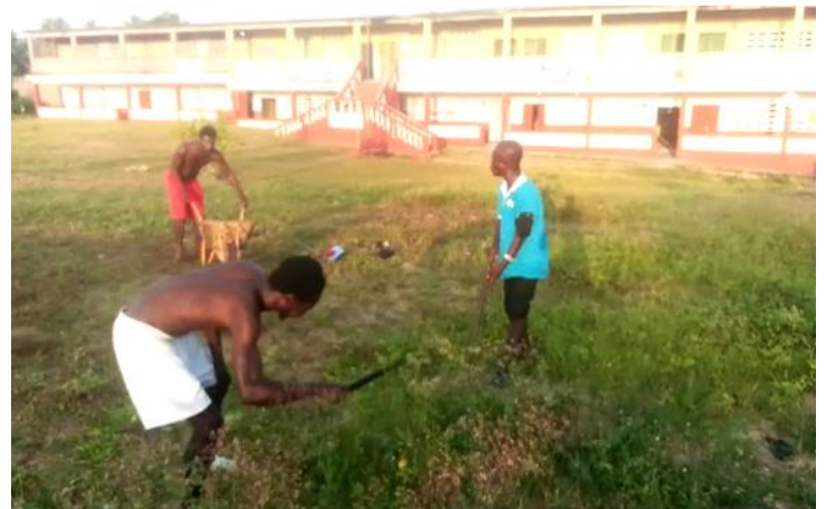
Figure 1: New-Site for the Technical / Vocational Training Center

Your donation is helping to save young girls who would have spent their evenings sleeping with men in order to save money for the next day's daily bread while learning a trade, children who have been home since the collapse of the school are having their hopes of starting school in January, families finding it difficult to feed their households due to the economic pressure of Covid-19 are being supported with food items and so are children under our care. All these people are having their dead hopes revived due to the support we receive from donors.